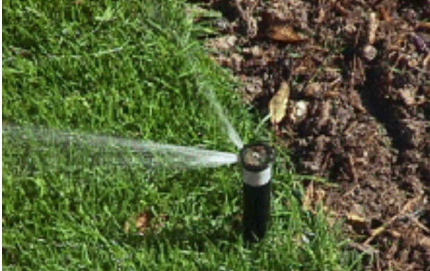
Example of a clogged nozzle

If these filters become fouled, then the spray pattern will not allow optimal coverage. The filter is typically located under the nozzle on the sprinkler. Unscrew the nozzle, remove the filter and flush with water or replace if needed.