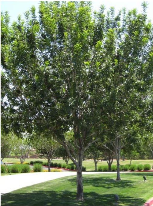
Fan-Tex Ash in late spring

Spring-Summer Tree Trimming, continued from page 1