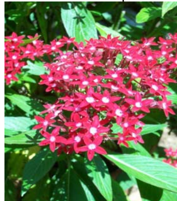
Pentas are a very hardy and colorful choice of summer annual.

To promote continual health and flowering, be sure to fertilize monthly with either a granular or foliar fertilizer. Certain flowers also respond to “deadheading” where spent blooms are removed from the plant. This will encourage continual blooming. Some great choices for summer annuals include Lantana, Vinca, Katie Ruellia, Zinnia, Pentas, Canna, Celosia and Coreopsis.